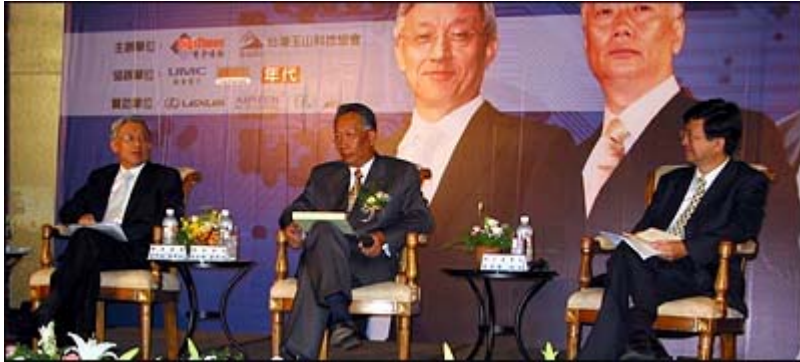
「台灣資訊電子產業新方向」研討會 (Aug 2002)