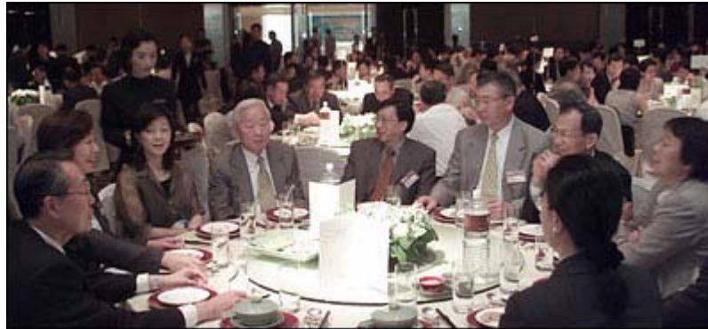
Monte Jade Taiwan Annual conference (Jun 2002)